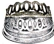
No. 11 Gallery —Used on No. 11, No. 10, No. 9, No. 8, No. 7 Model Aladdin with KoneKap Mantle. Satin and nickel finish.

In ordering specify Model Number and finish desired Price each, any style, 70c