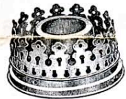
Gallery for Cap Mantle —For use only on No. 2 Model Aladdin in connection with Cap Mantle. Satin and Nickel finish.