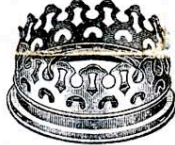
Gallery for KoneKap Mantle —Used on No. 3, No. 4, No. 5 and No. 6 Model Aladdin with KoneKap Mantle only. Satin and nickel finish.